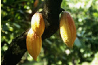
Cocoa Bean from which Cocoa Butter is derived