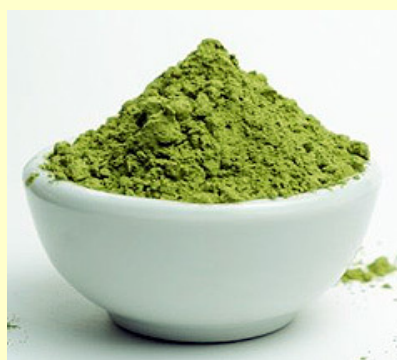
Ayurvedic Herbal Hair Powder (2 types available) and Henna Natural Hair Colourant

www.reviveholisticbeauty.com info@reviveholisticbeauty.com