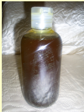
Nefertiti Hair Oil and Herbal Hair Oil