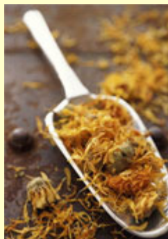
Calendula (Marigold) Petals

www.reviveholisticbeauty.com info@reviveholisticbeauty.com