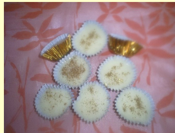
Christmas Range: Body Bling Massage Bars and Three Kings Bath Melts