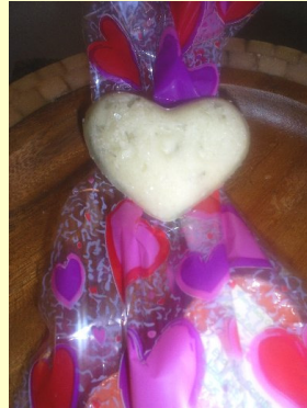
Valentines Day: Satin Sheets Wax Melts and Love is in the Air Bath Melts (His & Hers)