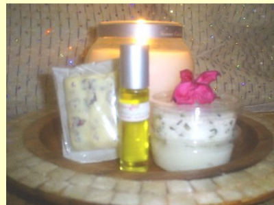
Top to Toe and Relax A vu Gift Sets